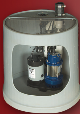
SafeBasements™ sump baskets are designed with a clear, removable, sealed lid for easy inspection and maintenance. With this sealed design the SafeBasements™ sump baskets work in conjunction with radon mitigation systems.