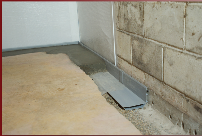
SafeDrain™ installation shown with optional wall encapsulation product.