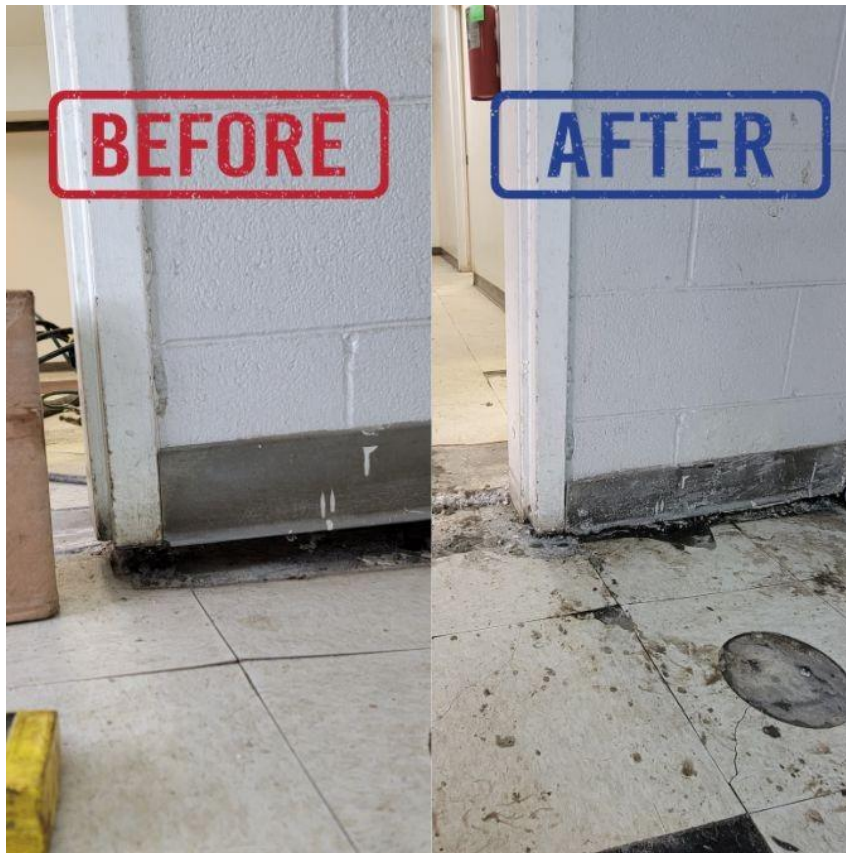
Before & after sinking foundation lift & stabilization