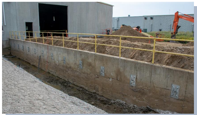
Top: Pulling back wall Bottom: Installed earth plate