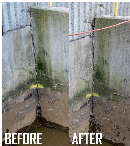
Retaining wall before & after wall anchors

Before the installation process began, excavation was performed by third parties directly behind the retaining wall to assist with the straightening of the wall. Once