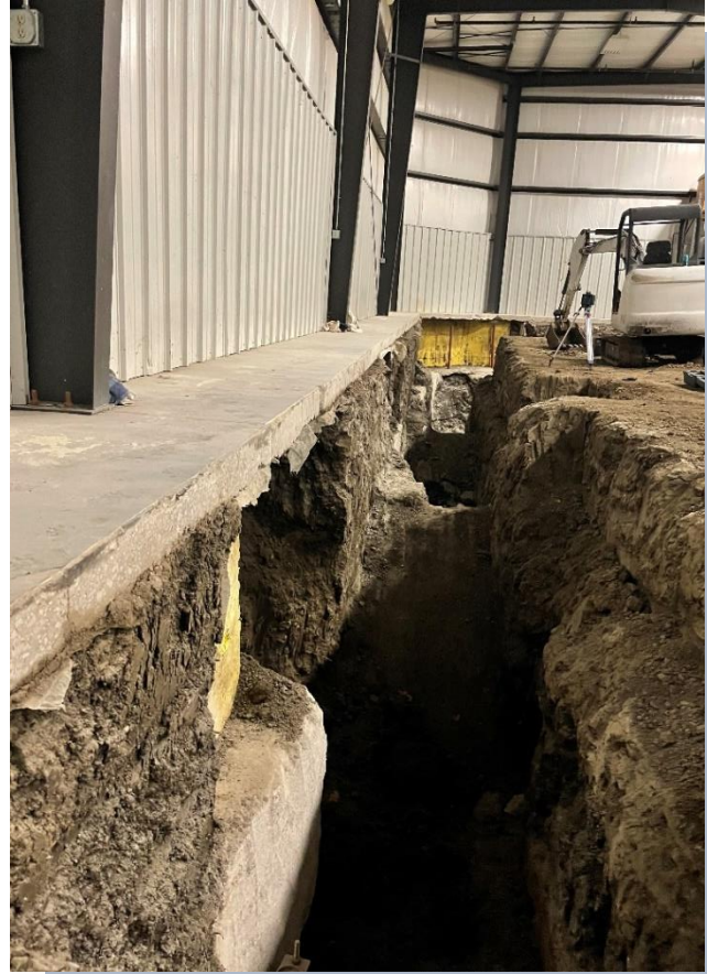
Above: Interior Excavation

after the exterior was excavated. The interior was also excavated in order to place piers on the interior side of the column footings. The push piers were driven to 49' and the lift was successful.