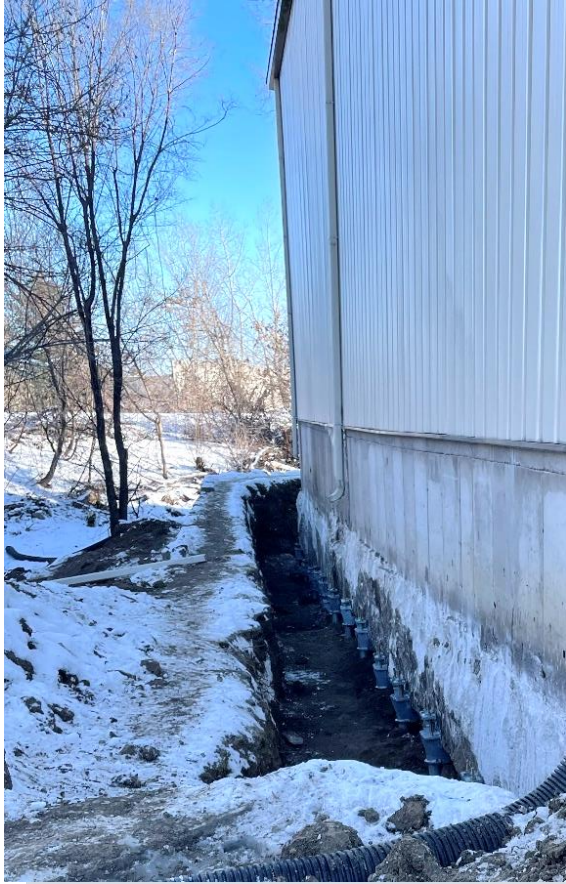
Above: Exterior Push Piers